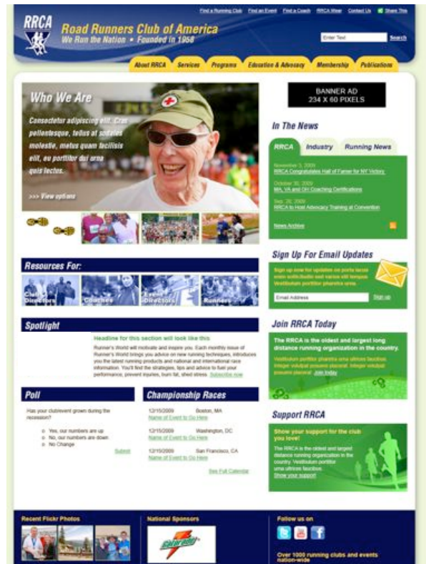
Image: Final design template of www.RRCA.org by the Matrix Group International

You may have noted as part of this website update process that we also streamlined the RRCA logo to remove the troublesome lines in the triangle. You can find the 2010 RRCA logo, RRCA Membership icon for websites and other updated RRCA branding items at www.rrca.org/services/rrca-branding/ . We encourage members to update their websites, print materials, etc. with the updated RRCA logo.